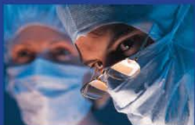
The patient is at the center of the team's work at all times.