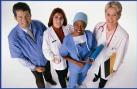
Multidisciplinary tumor board for treatment planning at NCCN centers

NCCN Multidisciplinary patient care team